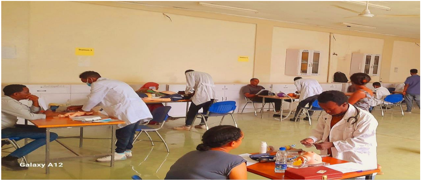
THE SAMPLE PHOTOS SHOW OSCE IMPLEMENTATION 2017