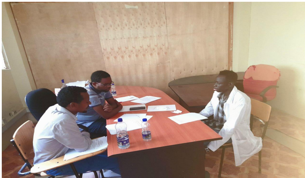
PHOTOS TAKEN DURING ORAL EXAM FOR ANESTHESIA STUDENT AT DDU BY ANESTHESIA DEPARTMENT, MESKEREM 2017