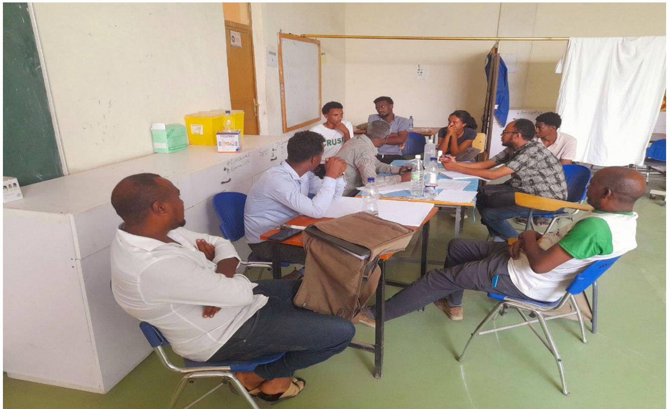
THE SAMPLE PHOTOS SHOW ENSURED STUDENTS REPRESENTATION INTO THE DEPARTMENT ASSEMBLY'S 2017