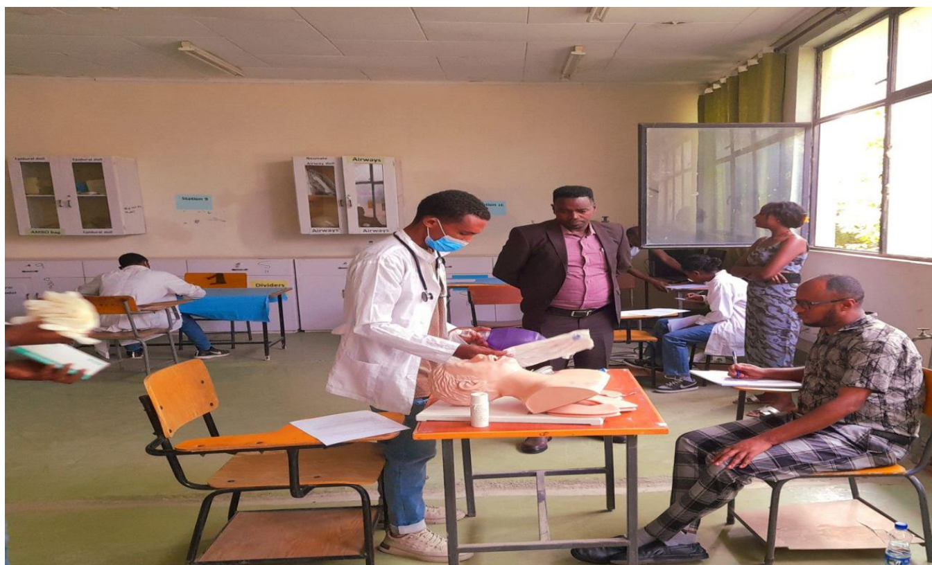
SUPERVISION BY COLLEGE DURING 4 TH YEAR ANESTHESIA OSCE AT DDU MESKEREM 2017